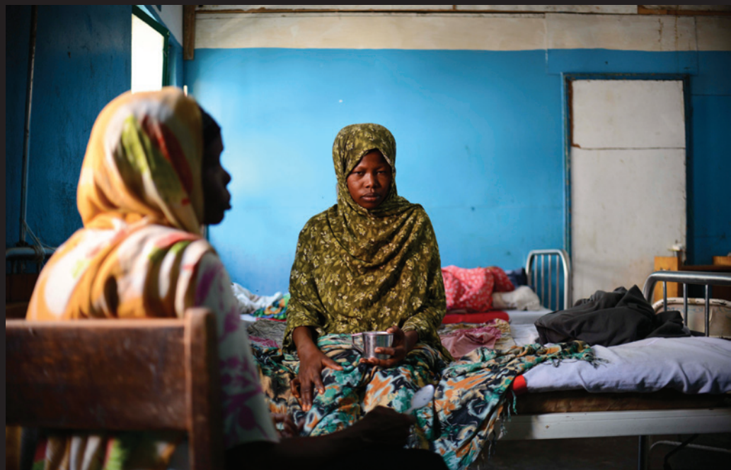
ABOVE, LEFT to RIGHT: AMISOM Police distribute food donations to blind IDPs / Patients admitted in Merka Hospital.