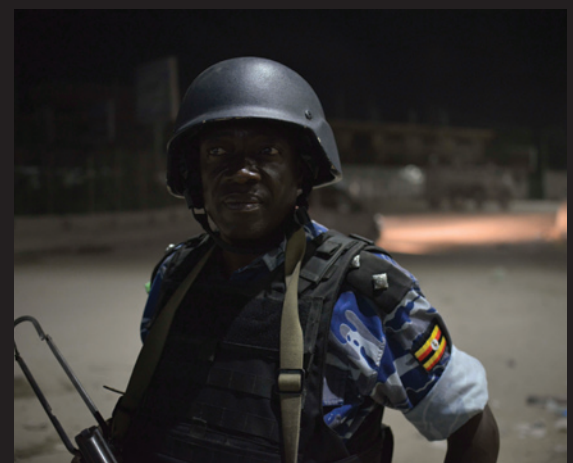
ABOVE, LEFT to RIGHT: Father holds child suffering from acute watery diarrhea in Beletweyne Hospital / Uganda FPU officer patrolling in Mogadishu's K4 area.