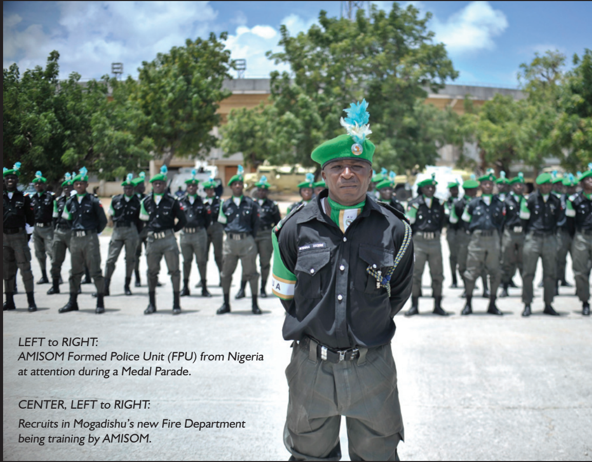
LEFT to RIGHT: AMISOM Formed Police Unit (FPU) from Nigeria at attention during a Medal Parade.