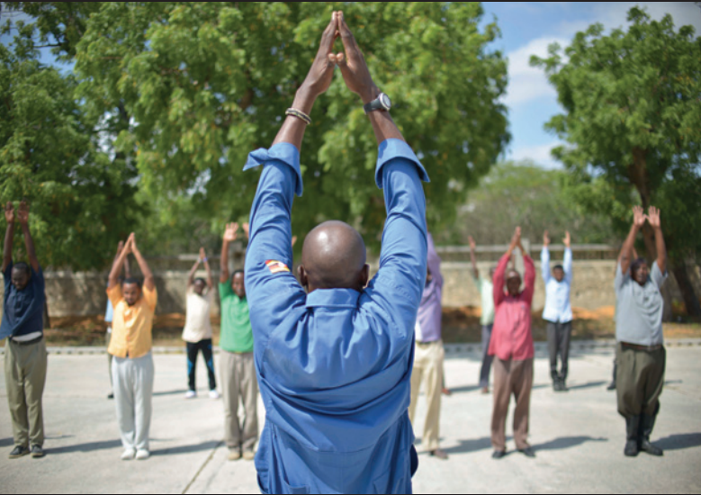
CENTER, LEFT to RIGHT: Recruits in Mogadishu's new Fire Department being training by AMISOM.