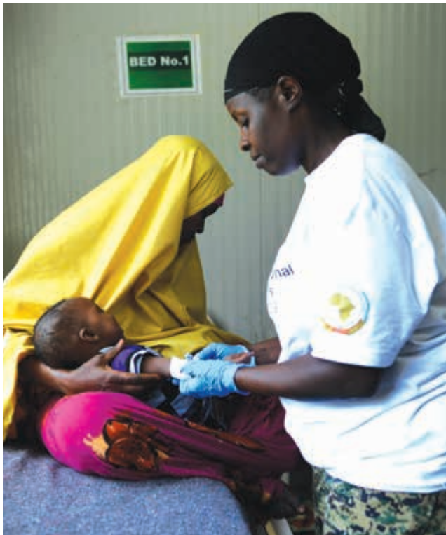
A Ugandan soldier serving under the African Union Mission in Somalia (MISOM) treats a child at the AMISOM hospital during the World Blood Donation Day in Mogadishu, Somalia.

M ogadishu – Every second, someone in the world urgently needs blood to save his or her life. Globally, blood transfusion saves millions of lives; however, in a country like Somalia where the need for safe blood is higher due to the effect of armed conflict and harsh living conditions, access to the precious fluid is still a major challenge. To help improve access to safe blood in Somalia, AMISOM troops, civilian staff and international partners gathered in Mogadishu to donate blood for use at the AU Mission's Level II Hospital, the Mission's largest medical facility in Somalia. The blood donation drive was part of a series of activities to mark the World Blood Donor Day, which is celebrated annually on 14 June.