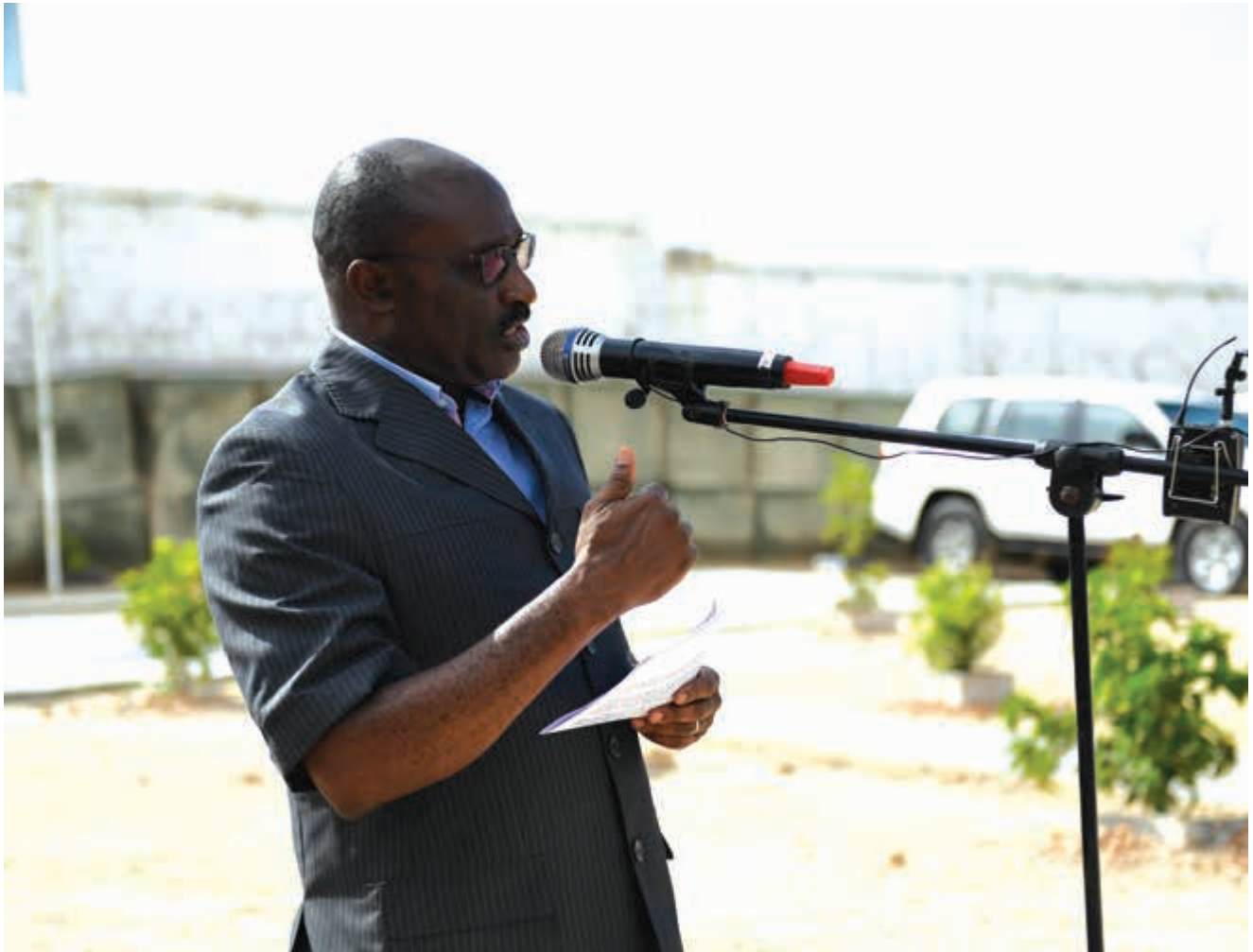
Simon Mulongo, the Deputy Special Representative of the Chairperson of the African Union Commission (DSRCC) for Somalia, speaks during the commemoration of the World Blood Donation Day in Mogadishu, Somalia.