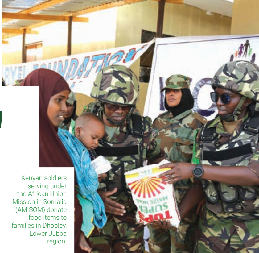
Kenyan soldiers serving under the African Union Mission in Somalia (AMISOM) donate food items to families in Dhobley, Lower Jubba region.