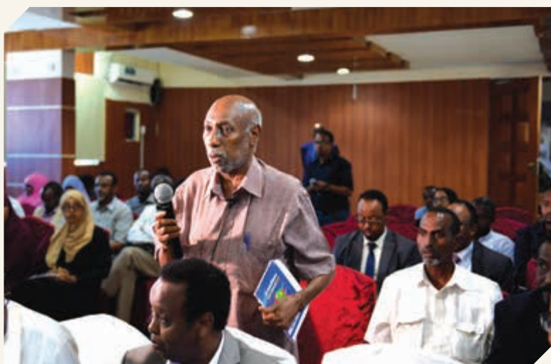
A participant speaks during a panel discussion on Somalia's 2020/21 Upcoming Elections in Mogadishu. The forum was organized by civil society organizations with the support of the African Union Mission in Somalia.

On 06 August, Somalia has launched a public awareness campaign to ensure that citizens keep abreast of preparations for the upcoming 2020/21 one-person-one-vote elections. The event was attended by representatives of the Federal Government of Somalia, Federal Members of Parliament, leaders of political parties and civil society groups. The United Nations, Electoral Institute for Sustainable Democracy in Africa (EISA) and the International Republican Institute (IRI) were also represented. Ahead of the elections, AMISOM will facilitate a series of town hall meetings to educate and update Somalis on