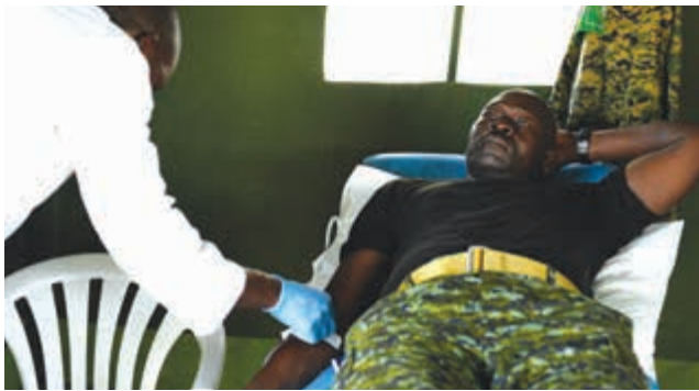
A Ugandan soldier serving under the African Union Mission in Somalia (AMISOM) donates blood at the AMISOM Sector One Headquarters during the World Blood Donation Day in Mogadishu, Somalia.

At AMISOM Level II Hospital, there is always a daily steady stream of local Somalis, among them, mothers seeking urgent medical care for their children, and others seeking surgical procedures that often need blood transfusion.