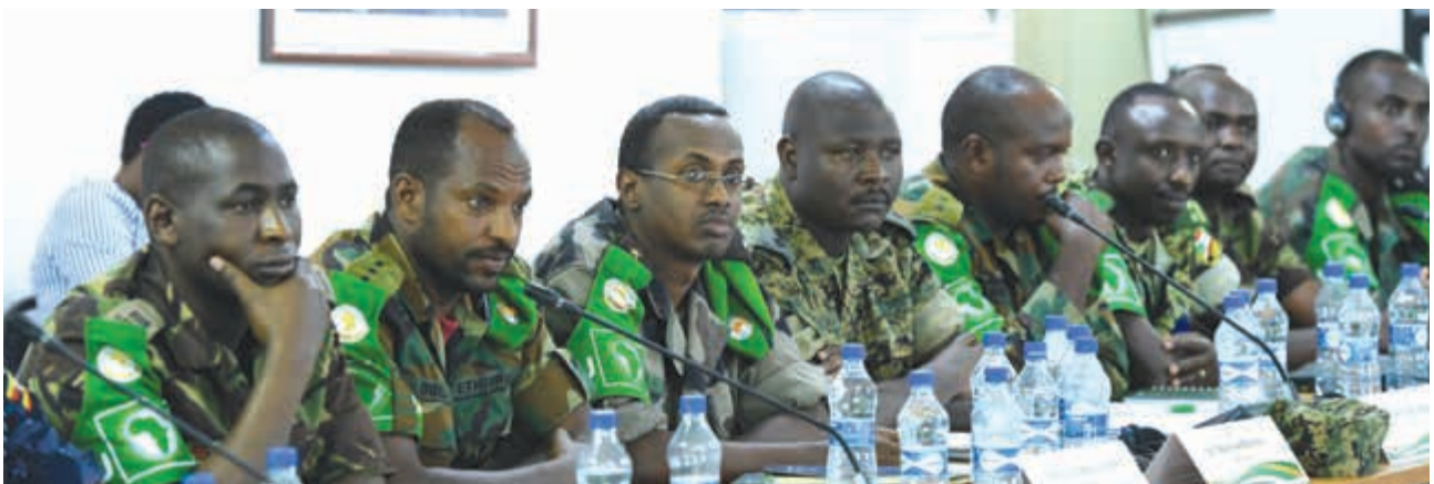
Military staff officers of the African Union Mission in Somalia (AMISOM), attend the AMISOM Boards Of Inquiry (BOI) workshop to review and harmonise the Standard Operating Procedures (SOPs). The workshop was held in Mogadishu, Somalia.