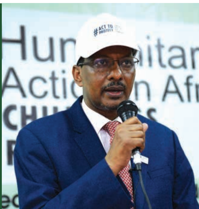
Hassan Hussein Haji, Somalia's Minister of Justice and Judiciary Affairs, addresses guests at a ceremony to mark the International Day of The African Child held in Mogadishu.

“Indeed, we are proud to say that we now have a pool of Somali trainers across the country capable of carrying out training on child protection. This is a major milestone in the promotion of human rights in the country,”