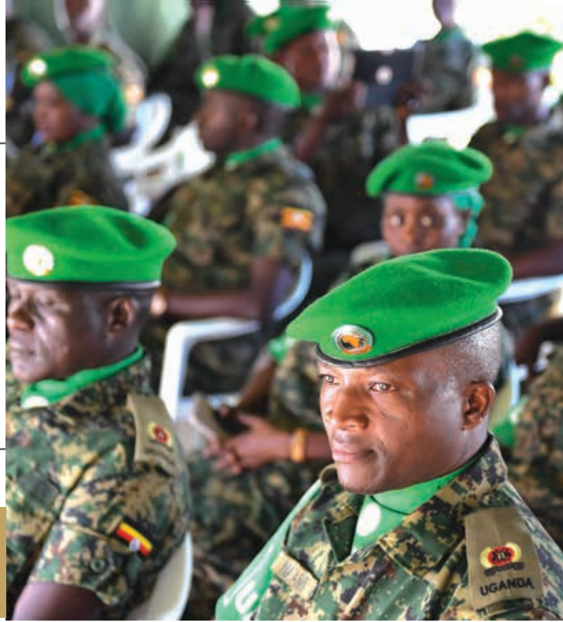
Ugandan soldiers serving under the African Union Mission in Somalia (AMISOM) attend their medal award ceremony in Mogadishu on, after they completed their tour of duty in Somalia.

M ogadishu - On 18 July, AMISOM awarded medals and certificates to a Ugandan battle group for its contribution to peace and stability in Somalia.