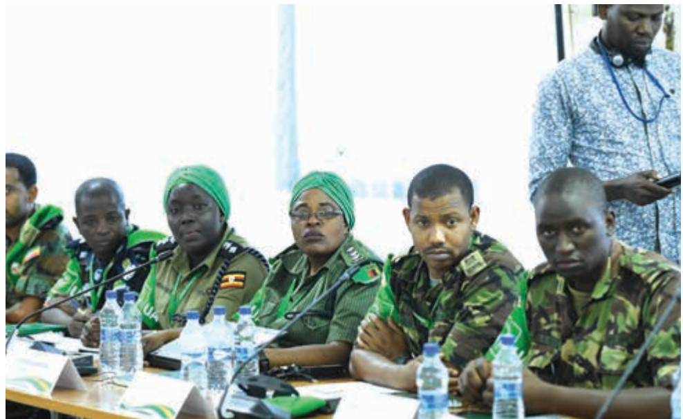
Civilian and military staff of the African Union Mission in Somalia (AMISOM), attend the AMISOM Boards Of Inquiry (BOI) workshop to review and harmonise the Standard Operating Procedures (SOPs). The workshop was held in Mogadishu, Somalia.

Apart from compensating its personnel, in 2016 AMISOM began a process of making amends to civilians who suffer harm as a result of its operations in the country.