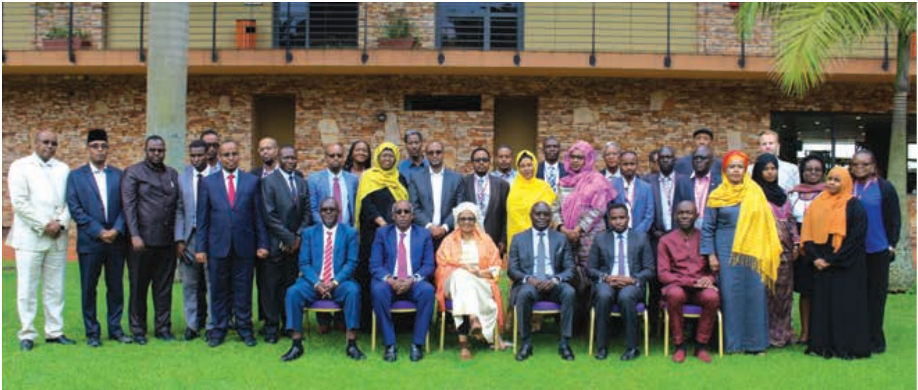
Participants pose for a group photo at the opening ceremony of a workshop on Electoral Security and Dispute Resolution in Kampala, Uganda. The workshop was organized by the African Union Mission in Somalia (AMISOM).