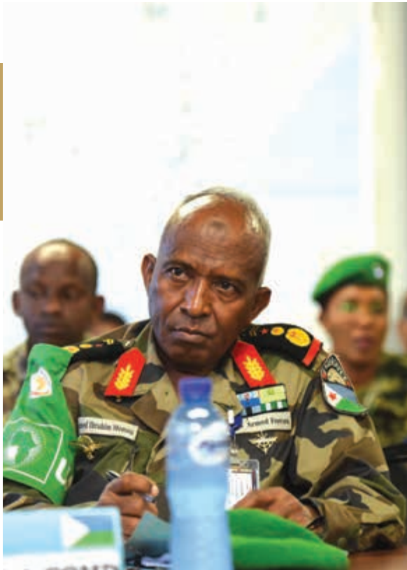
Senior military officers of the African Union Mission in Somalia (AMISOM), attend the opening session of AMISOM sector commanders' conference in Mogadishu, Somalia.

M ogadishu - On 07 July 2019, AMISOM contingent commanders concluded a meeting during which they resolved to enhance coordination with the Somali security forces to implement the Somali Transition Plan.