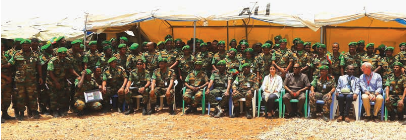
Senior officials from the African Union Mission in Somalia (AMISOM) and officials from the United Nations in a group photo at the end of a medal award ceremony for Ethiopian soldiers who concluded their tour of duty under AMISOM in Beletweyne, Somalia.