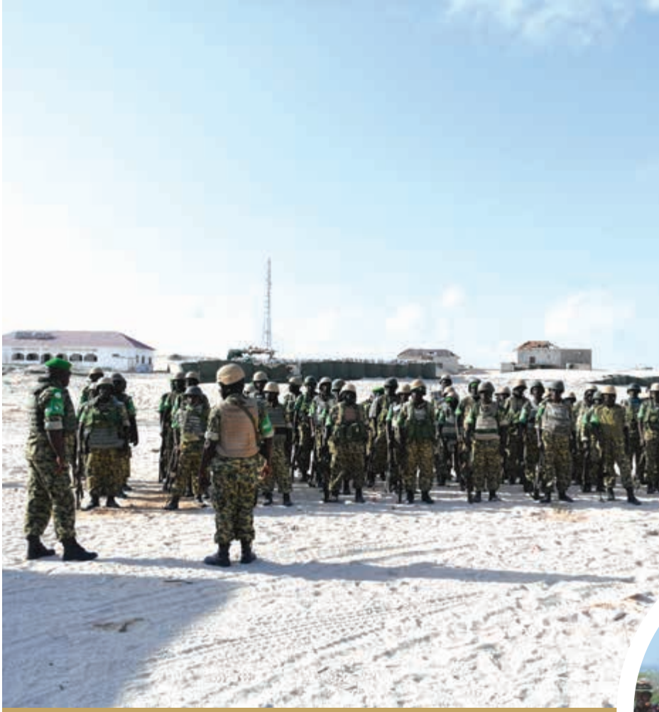
Burundian soldiers serving under the African Union Mission in Somalia (AMISOM) on parade at Warsheikh Forward Operating Base (FOB) in Warsheikh District, in Middle Shabelle region. A ceremony to hand over the FOB to the Somali security forces