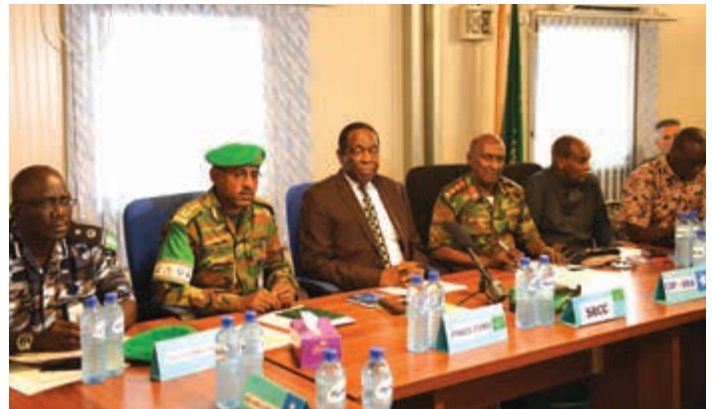
Ambassador Francisco Madeira, the Special Representative of the Chairperson of the African Union Commission (SRCC) for Somalia, senior military officers of the African Union Mission in Somalia (AMISOM) and Somali National Army (SNA), attend the opening session of the sector commanders' conference in Mogadishu, Somalia.

security responsibility to Somali security forces ahead of AMISOM's anticipated exit in 2021.