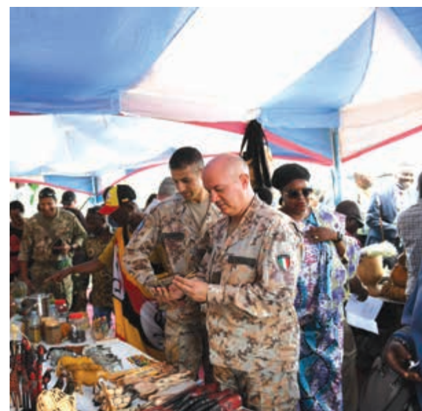
Guests tour stalls during a cultural event organised by Ugandan contingent serving under the African Union Mission in Somalia (AMISOM), in Mogadishu, Somalia.