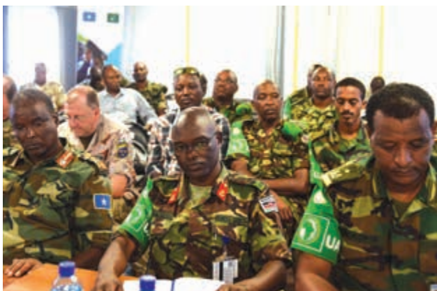
Senior military officers of the African Union Mission in Somalia (AMISOM), Somali National Army (SNA), and international partners attend the closing session of AMISOM sector commanders' conference in Mogadishu, Somalia,

During the meeting, the commanders also discussed the operational readiness of the Somali security forces, which is crucial to the successful implementation of the Somali Transition Plan. Under the transition plan, AMISOM will transfer