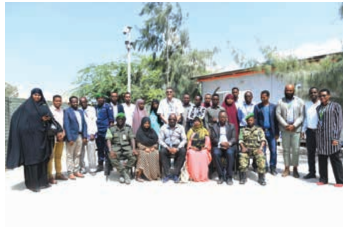
Senior officials of the African Union Mission in Somalia (AMISOM) and Somali civil society representatives, in a group photo at the end of a meeting held in Mogadishu, Somalia. The conference aimed to promote mutual recognition and information sharing between AMISOM and civil society organizations in Somalia.