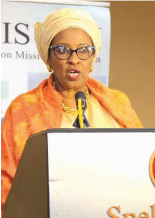
Halima Ismail Ibrahim, the Chairperson of Somalia's National Independent Electoral Commission (NIEC), addresses participants during the opening ceremony of a workshop on Electoral Security and Dispute Resolution in Kampala, Uganda. The workshop was organized by the African Union Mission in Somalia (AMISOM).

"The success of Somalia will be the success of Africa and will ultimately contribute to our continental aspiration of achieving Agenda 2063: The Africa We Want,"