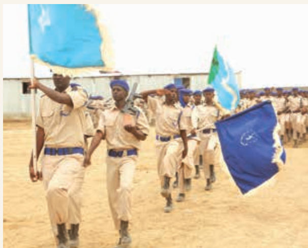
HirShabelle State Police personnel march on parade during a pass-out ceremony to mark the completion of training in Jowhar, Somalia

Jowhar - On 29 August, the graduation of 197 police officers from HirShabelle State made a vital step in visible policing, which is crucial in maintaining law and order and protection of life and property.