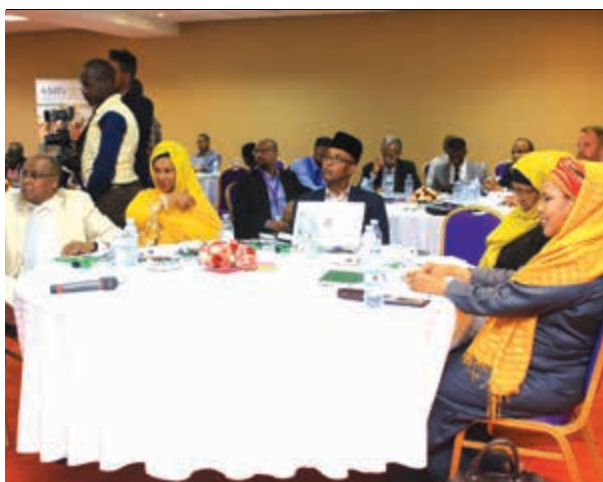
Participants attend a workshop on Electoral Security and Dispute Resolution in Kampala, Uganda. The workshop was organized by the African Union Mission in Somalia (AMISOM).