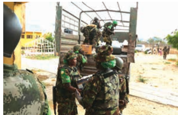
Kenyan soldiers serving under the African Union Mission in Somalia (AMISOM) offload food items donated to families in Dhobley, Lower Jubba region.