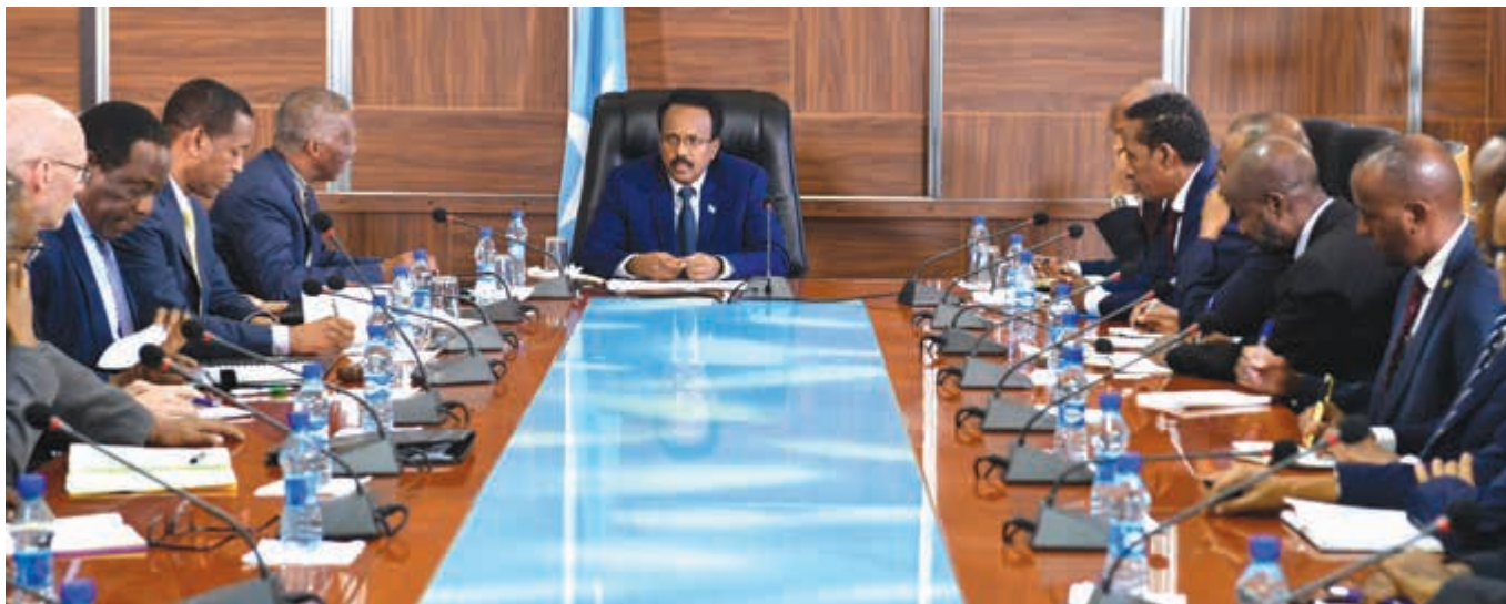
The President of Somalia, Mohamed Abdullahi Mohamed 'Farmajo,' and members of his cabinet in a meeting with the former President of South Africa, Thabo Mbeki at Villa Somalia in Mogadishu, Somalia. President Mbeki led the African Union High-Level Implementation Panel which also comprised of IGAD and UN officials, on a consultation mission to Somalia.