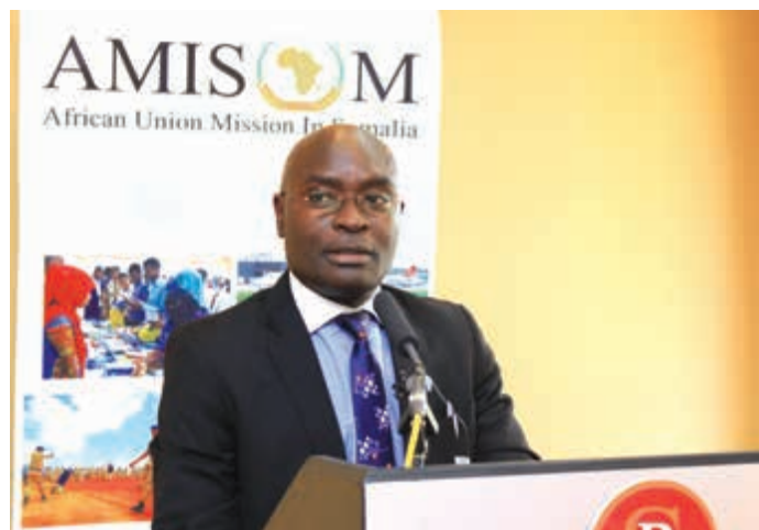
Simon Byabakama (left), Chairperson of the Uganda Electoral Commission addresses participants during the opening ceremony of a workshop on Electoral Security and Dispute Resolution in Kampala, Uganda. The workshop was organized by the African Union Mission in Somalia