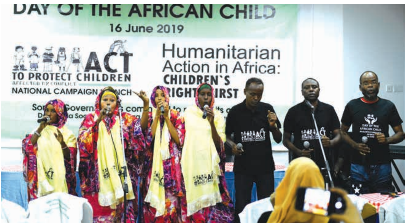
Somali singers perform during a ceremony to mark the International Day of The African Child held in Mogadishu