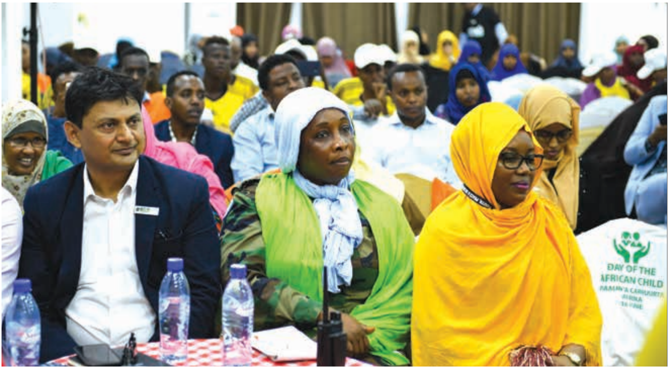
Guests attend a ceremony to mark the International Day of The African Child held in Mogadishu, Somalia