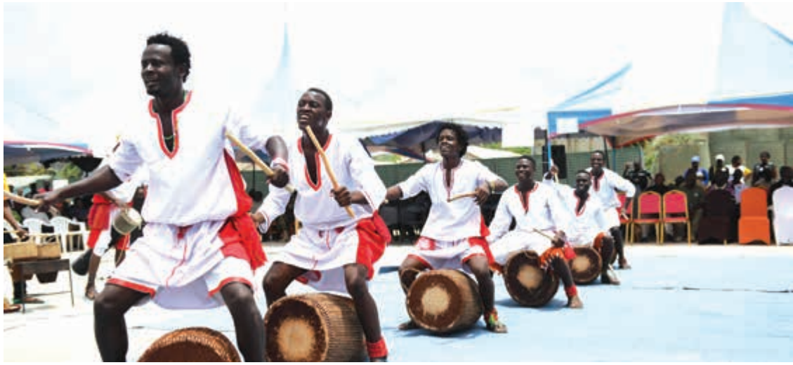
Traditional dancers perform during a cultural event organised by Ugandan contingent serving under the African Union Mission in Somalia (AMISOM), in Mogadishu, Somalia.

Mogadishu - On 31 August, AMISOM Sector One, which is under the command of Uganda People's Defence Force (UPDF) held a gala marked by traditional dance performances and a cultural exhibition to display how peace and unity can prevail in culturally diverse communities.