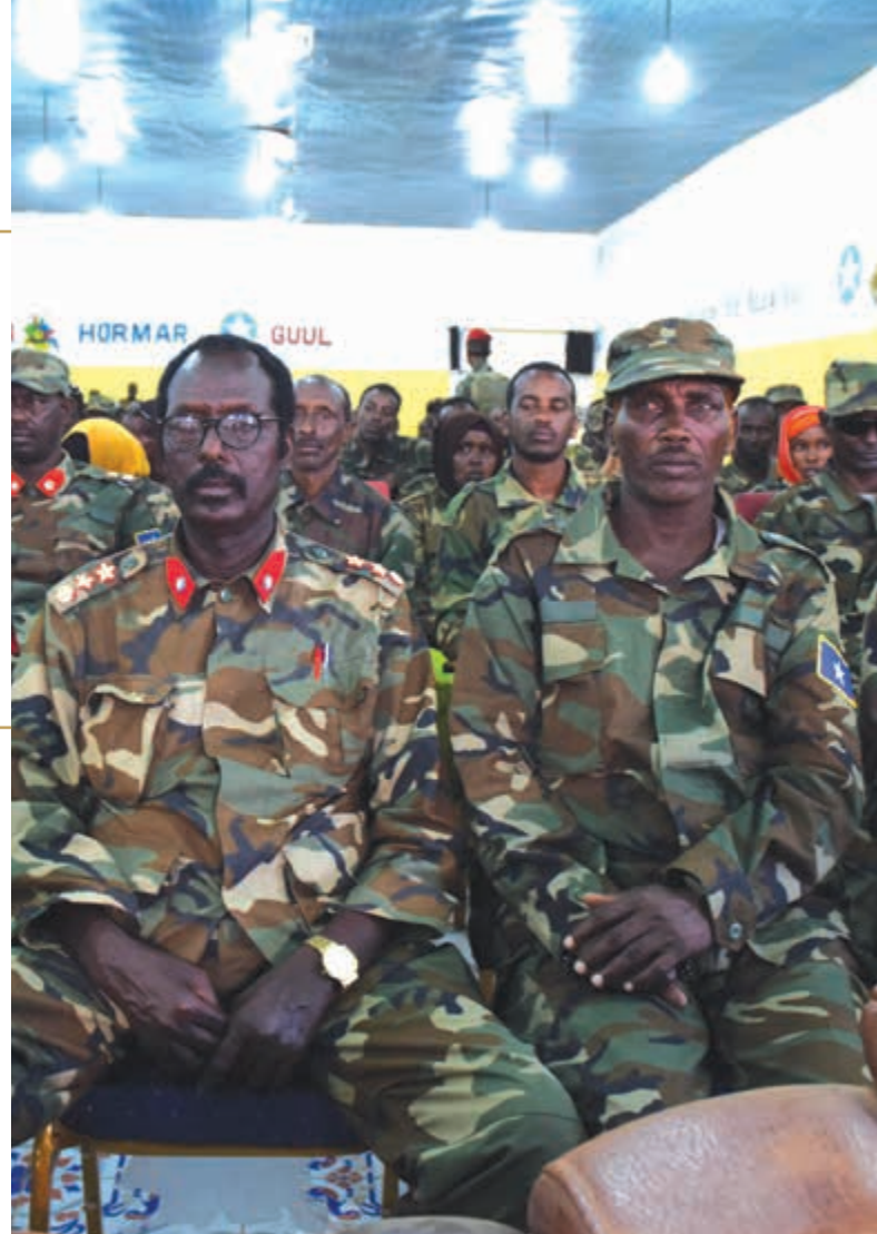
Ahlu Suna Wal Jama'a soldiers attend the launch of a process to integrate them into the Somali Security Forces in Dhusamareb, Galmudug, Somalia.