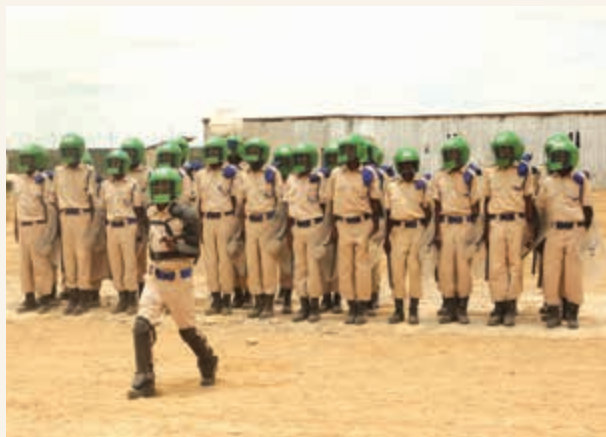
HirShabelle State Police personnel demonstrate skills during a pass-out ceremony to mark the completion of training in Jowhar, Somalia