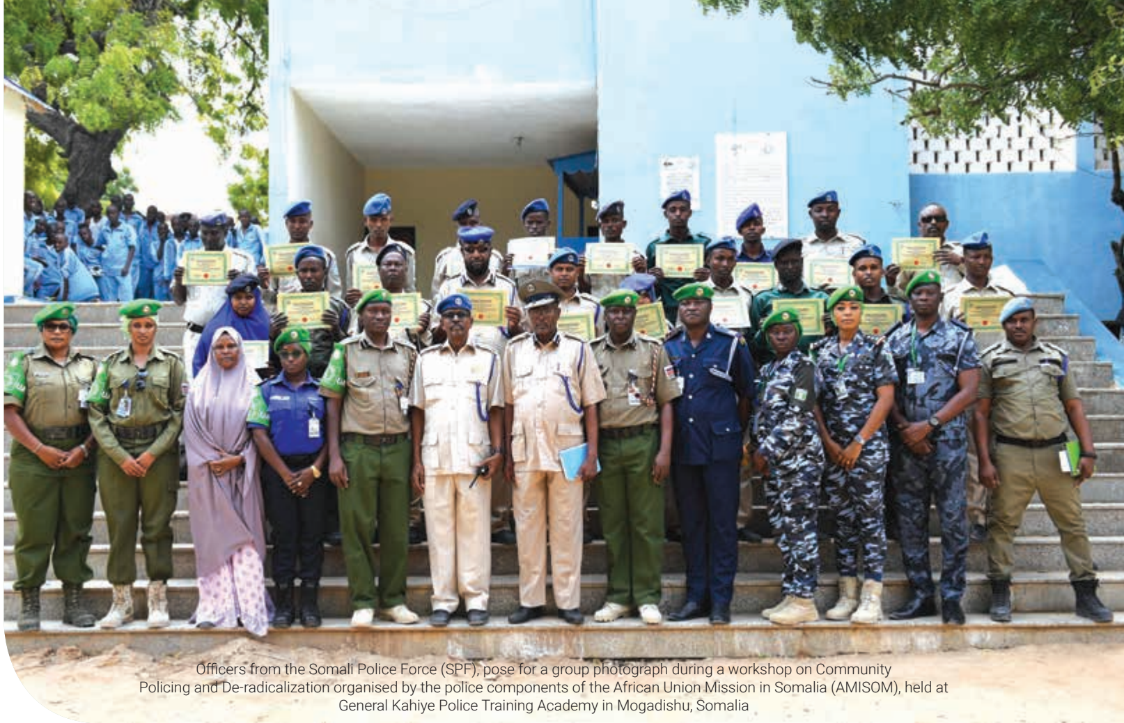
Officers from the Somali Police Force (SPF), pose for a group photograph during a workshop on Community Policing and De-radicalization organised by the police components of the African Union Mission in Somalia (AMISOM), held at General Kahiye Police Training Academy in Mogadishu, Somalia